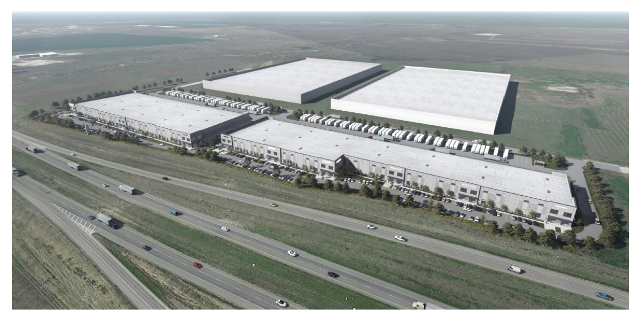
Image 5 rendering showing Provident Reality Advisors first two buildings with Sunrider building massing behind

buildings (184,406 and 159,543 square feet). Provident has leased 45,360 square feet and is finalizing two leases on an additional 184,406 square feet. Provident will submit building plans for their third building soon.