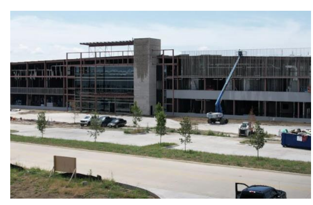
Image 4 Facade being installed on the Sunrider Manufacturing building

In January 2021, Arco Ventures closed on 6.5 acres and is currently constructing 100,149 square foot speculative industrial building. In October 2021, Provident Realty Advisors closed on 58 acres. Provident has just finishing the construction of two